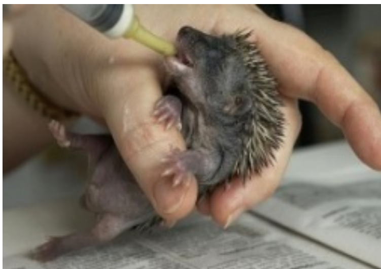
This is the correct position to hold suckling hedgehogs when they are given milk. Note the syringe on top (without needle of course) and without a rubber teat, obtainable from the vet.

The first meal given to the little hedgehogs should consist of fennel or chamomile tea only. This is not only due to the fact that hedgehog babies are usually dehydrated at the time of discovery, since they may have not received nourishment for quite some time, but also because the baby, due to the new and inexperienced mother, the milk can easily go sideways. If the mother's milk surrogate enters the lungs, the consequence will usually be fatal pneumonia. You must therefore be careful. The first day, give small portions to slowly accustom the baby to the new milk.